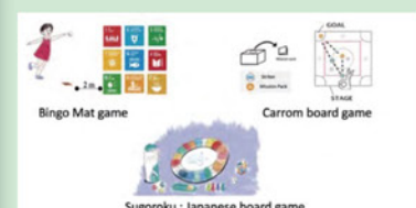
Fig. 4 SDGs educational games