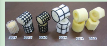
Fig. 2 Different generations of DHS sponges