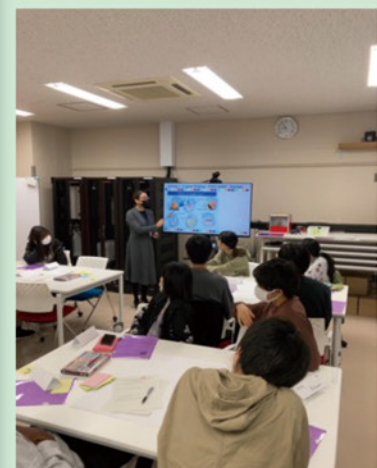
Fig. 3 Problem based Learning for solving SDGs